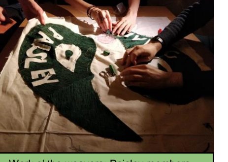
Work o' the weavers: Paisley members crafting the group's banner

When we come together and realise our collective strength as tenants, landlords run scared. Join Living Rent today to fight for your rights and to build a housing system for the people - not for profit.