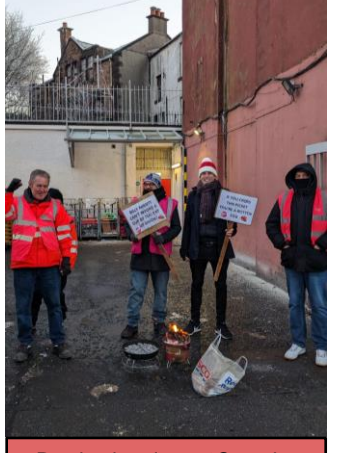
Posties braving -7°C on the picket line at Renfrew Delivery Office, December 2022

AS THE COST OF LIVING CRISIS DEEPENED in 2022, workers all across the country fought back - and will continue their fight into the new year. Hundreds of thousands of workers have decided to down tools and grind their respective industries to a halt. Why have they stopped the trains running, your post getting delivered, your children's schooling?