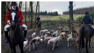
Long run the fox! Fox hunters in Renfrewshire were finally defeated earlier this year

After 252 years of hunting wildlife, the Lanarkshire & Renfrewshire Foxhounds met for the final time on Saturday 4th March 2023.